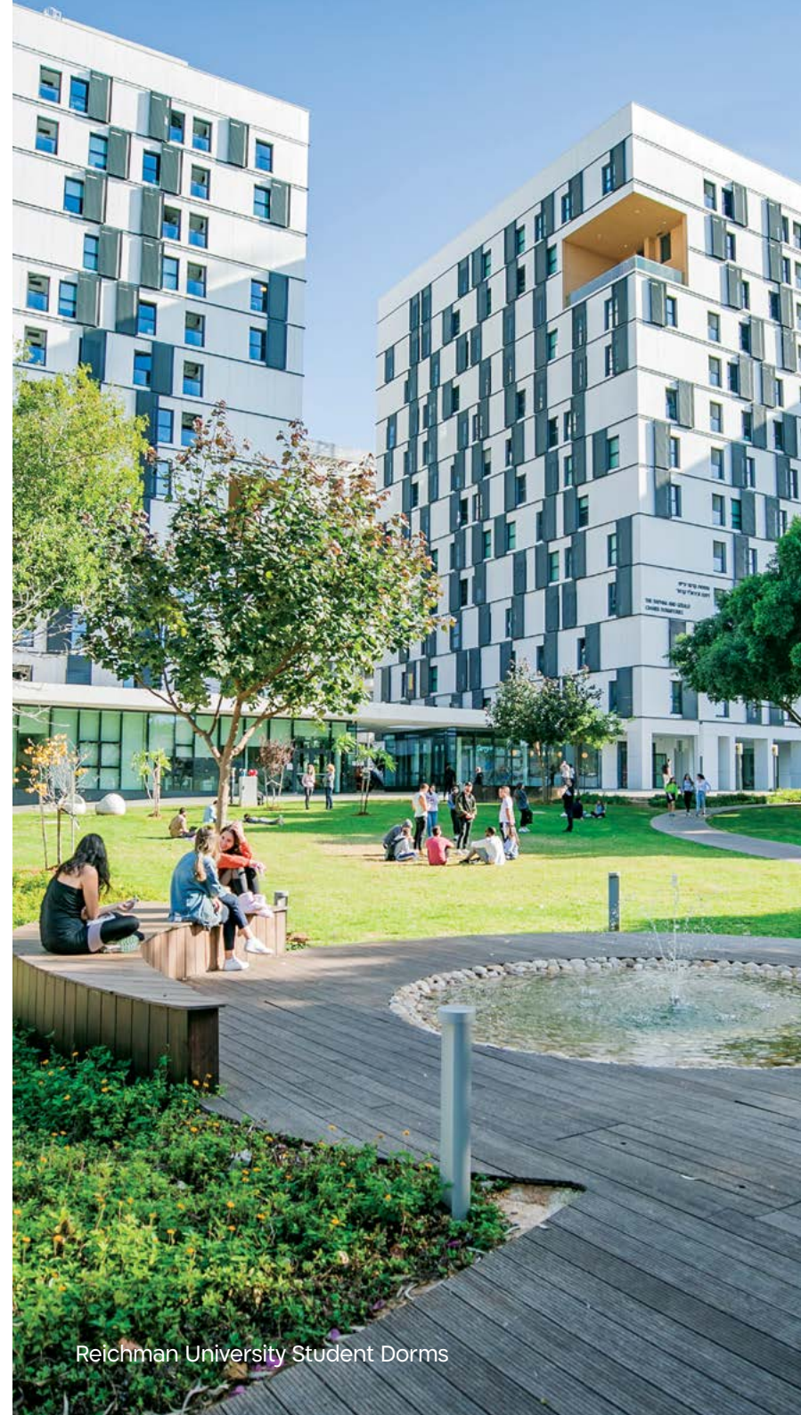
Reichman University Student Dorms