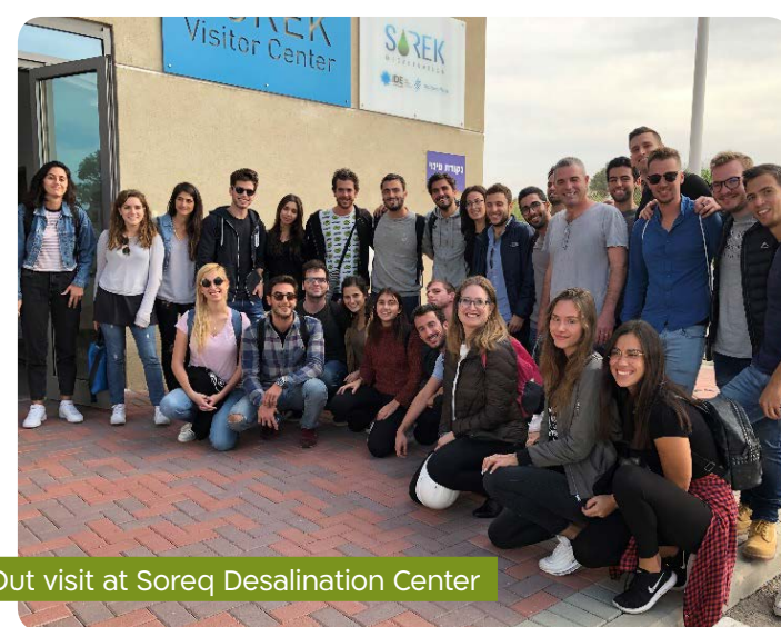
Out visit at Soreq Desalination Center