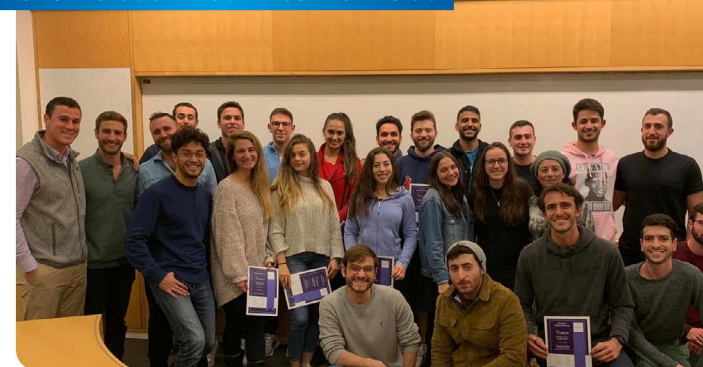
The IG - Student Led Investment Club