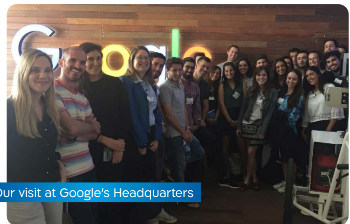
Our visit at Google's Headquarters