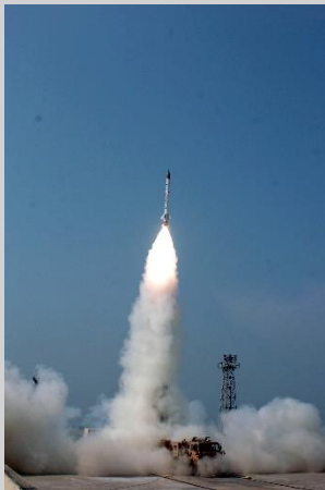
India: Prhitvi AD