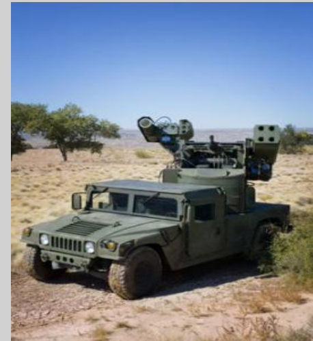
Advanced Tactical Laser