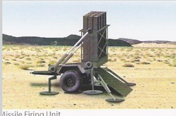
Missile Firing Unit