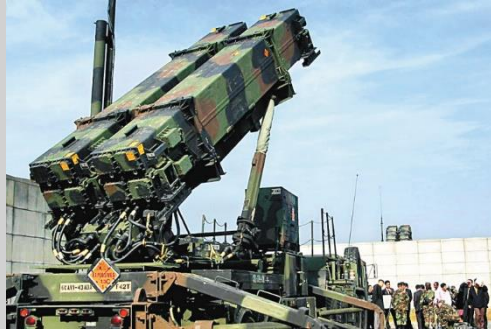
Patriot PAC 3