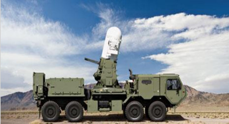
Phalanx B (US)