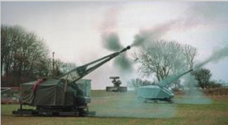
Oerlikon Skyshield (Eu)