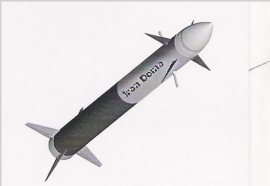
Iron Dome interceptor

Optimized against light and man portable rockets (“Kassams” and “Katyusha”)