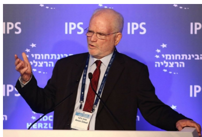
Major-General (Ret.) Amos Gilead received the "Knights of Government Quality" Award of 2020