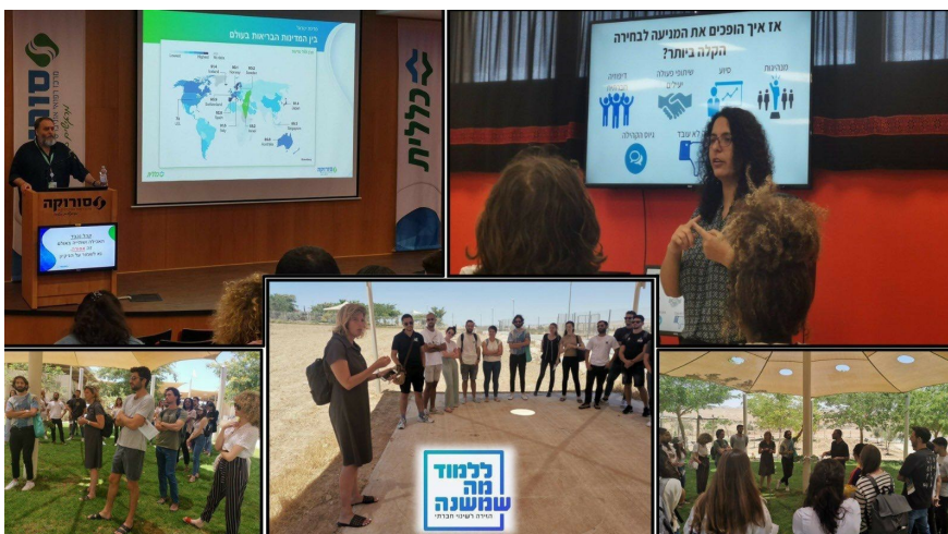
Arena for Social Change Concluding Field Trip, June 2021.

The Arena for Social Change program, supported by the Konrad-Adenauer Foundation and led by the Lauder School of Government, exposes students to decision-making processes and key nodes of influence in the Israeli public.