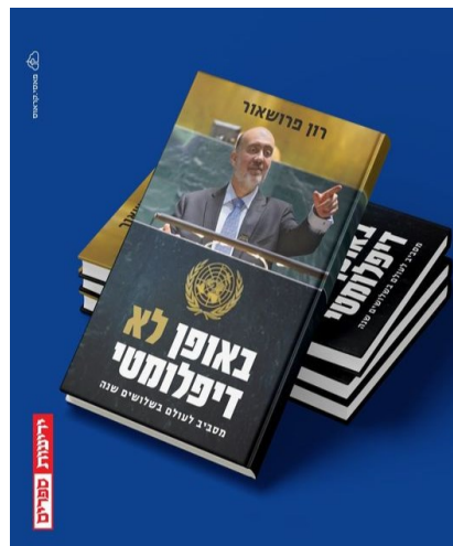
Ambassador Ron Prosor נאופן לא דיפלומטי מסביב לעולם בשלושים שנה May 2021 ידיעות ספרים