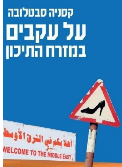
Ksenia Svetlova על עקבים במוזרח התיכון October 2020 פרדס הוצאה לאור